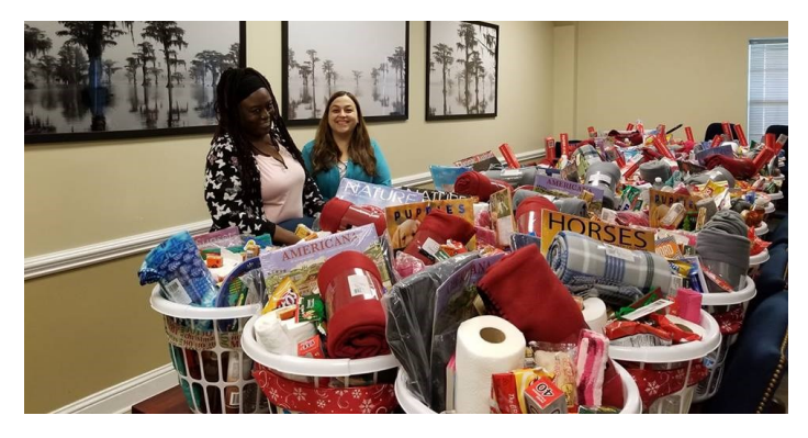
"Baskets of Love" pictured above were delivered to needy seniors throughout the region.